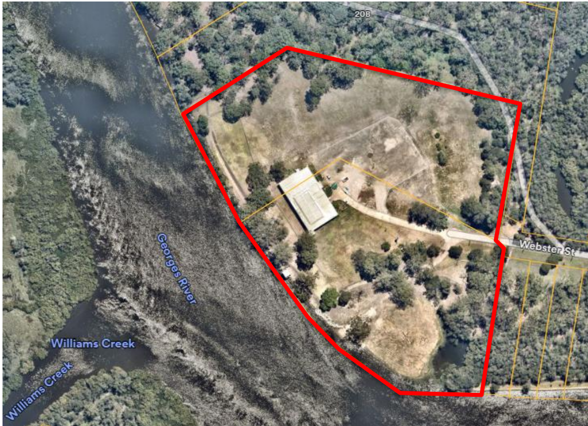
Figure 2: An aerial map of the subject site, 30 and 31 Webster Street, Milperra. The site is mostly cleared and includes a large existing building. (Source: Nearmap, January 2025)

Council approved a Development Application for the site (DA-224/2014) which included additions to the existing Deepwater Motor Boat Club building accommodating a first floor function centre, new restaurant, landscaping, carparking. These works have commenced on the site. Prior to Council's adoption of the former Bankstown Local Environmental Plan 2015, function centres and restaurants were permitted on the site. The current planning proposal is simply seeking to formalise the function centre and restaurant/café uses on the site to reinstate their previously long standing permissibility. All existing Council and State planning bushfire related controls will continue to apply to the site and any future development.